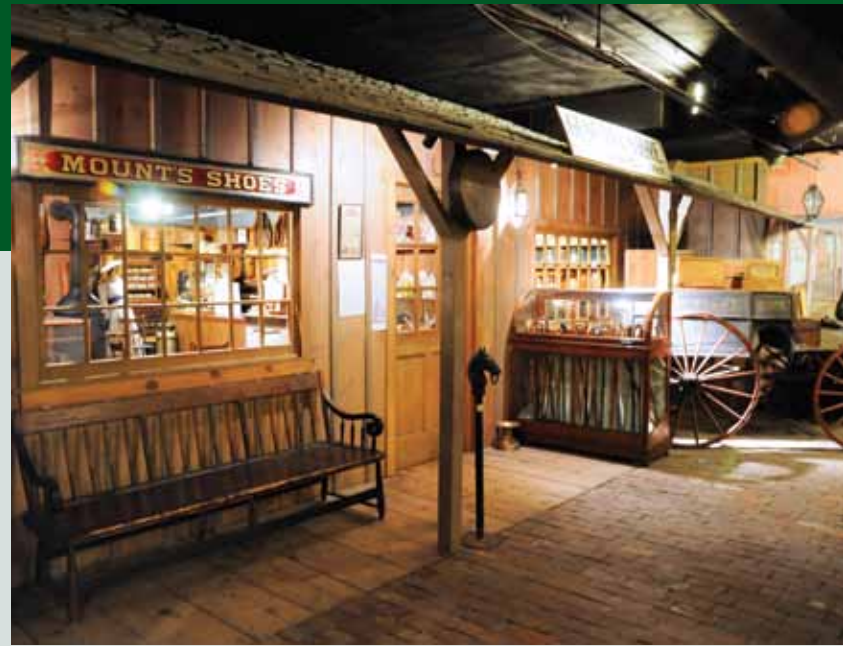
Wayne County Historical Museum