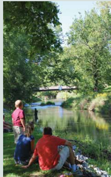
Enjoying the water near Cambridge City.