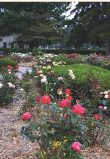
Richmond Rose Garden

Fountain City Lions Helping Hand Fund-1989