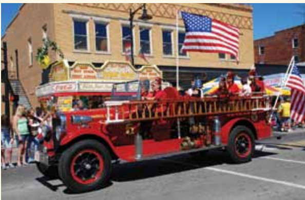
Canal Days, Cambridge City, Indiana