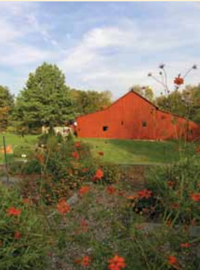
Cope Environmental Center

The Foundation awarded $1,379,754 in grants and scholarships in 2009. This total includes grants from agency funds and agency designated funds, as well as awards made through the Foundation's own discretionary grant-making and interfund transfers. These distributions reflect our donors' many interests, as well as needs identified in the community.