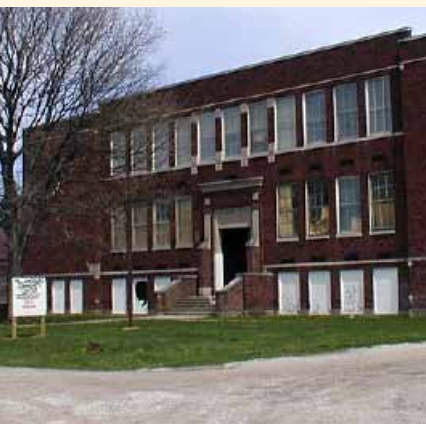
Williamsburg Community Center

John Harlan Fund for the Wayne County Historical Society-2008 ($104,306) Created from the John M. Harlan Charitable Remainder Trust, this fund will support the Wayne County Historical Society.